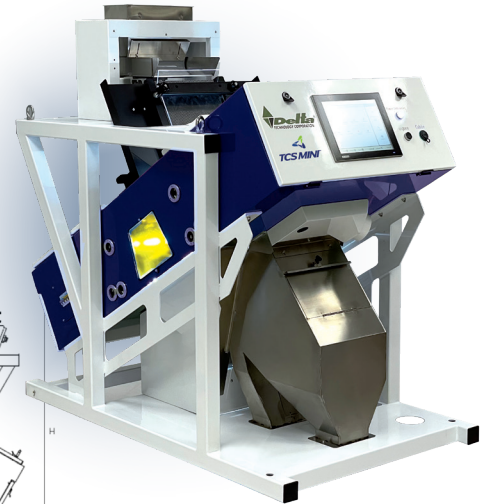
TCS sorters can be remotely accessed and controlled from any smartphone, tablet or PC.